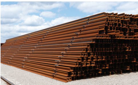
This facility welds these shorter pieces of rail into sections of Continuous Welded Rail (CWR) up to 1600' long...