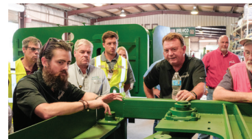
Goldston also shows off a vertical incisor destined for Koppers - Florence, S.C., that features a new replaceable ninja-star-like tooth that doesn't require removing the entire incisor head AND a new optical smart cylinder designed to pre-position the incisor heads to assure maximum incising of the tie.