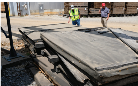
...the two different kinds of air stickers they use to minimize shadow lines on the lumber, and these very unique fabric-based covers for...