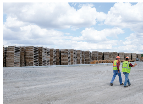
We also get to see the terrific plant layout.