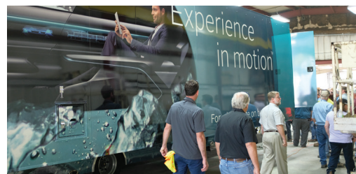
Behind Brewco Inc.'s shop is Brewco Mobile Marketing (BMM - not affiliated with Brewco, Inc.). BMM builds and wraps trailers and other vehicles for some of the biggest names in the business to take their show on the road. Kohler, McDonalds and Kroger were some of the examples we saw.