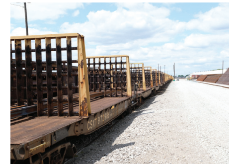
...next to a same length rail train that's being loaded as the CWR rail sections are completed.