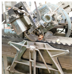
We also get to see an automated band saw sharpening system grinding away.