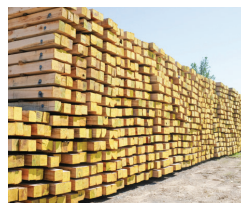
In addition to the vast styles and quantities of pallets made here they also make and keep a nice selection of crane mats inventoried.