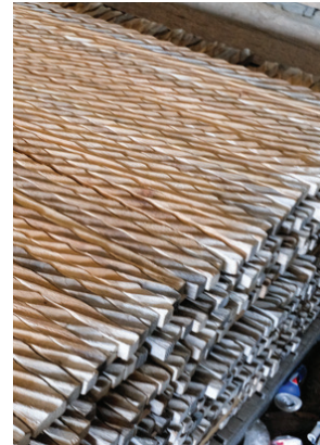
...paying attention to specially designed and manufactured lumber stickers they use to minimize shadow lines on grade lumber.