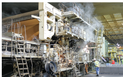
No, it's not The Borg (from Star Trek - Next Generation), but rather a fantastic Hood Industries brown paper making machine running at 30 feet per second. Our host was asked if they should think about producing the best corrugated box paper in the world and he said, "Make it so!"