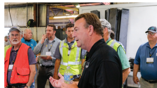
Brewco is focused on four markets: grade lumber, ties, pallets and barrel staves. Brewco's fabricators, each with 12-20 years of experience, are some of the longest tenured in the business.