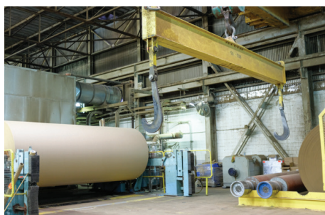
The paper piles onto a two-plus-ton roll and then gets cut into manageable lengths for distribution to corrugated box manufacturers.