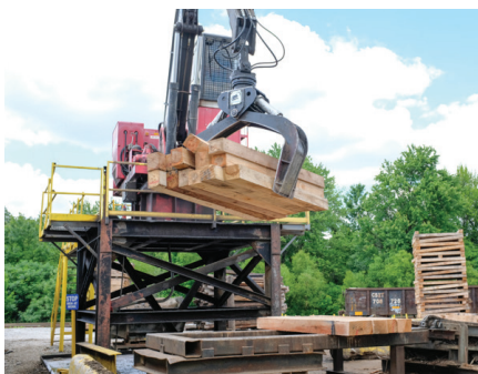
Out in the plant we see how cars are unloaded and ties placed in line for processing.