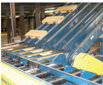
Day 2 starts with another jaunt into Kentucky where we visit Associated Pallets. Here, we see sawn cants rolling toward a gang rip saw that will turn them into pallet blocking and slats.